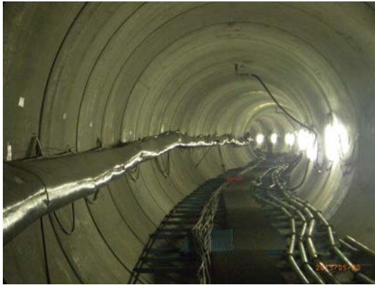
S-shaped curve of inner diameter \Phi 3,500 m/m and R=200

Project name: CILIWUNG SUDETAN KBT PROJYECT Project cost: Paid by Indonesian Government Purpose of project: Project to prevent flooding in Jakarta City by connecting the former Ciliwung River and the existing flood control channel, Banjir Canal, with an underground tunnel.