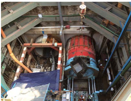
Starting condition (shield machine outer diameter \Phi 4,100 m/m)